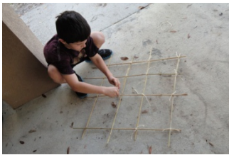
Constructing the frame using 8 three-foot-long ¼” diameter sections of bamboo