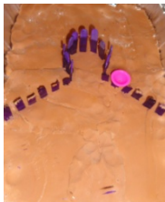
V-Weir, fish swims over barrier at high tide

For each team of two students: 10-20 popsicle sticks, a foil pan at least 2” deep with a substrate in the bottom that popsicle sticks can be stuck into, like sand. Modeling clay was used in the images below. A handful of Cheerios or other tiny floating object. For class: A water source, several watering cans. Towels to dry up spills. Teacher Tip 1: Students will be tempted to tip the foil pan to try to force their fish to swim down the incline. However, floating objects don’t move with the tide, they just bob. The best way to simulate fish movement is to nudge your “fish” purposefully in the downstream direction. Teacher Tip 2: Tide charts are expressed in feet, not meters, so this activity will remain in standard measurements. Teacher Tip 3: Colored popsicle sticks look nice, but the color bleeds when they get wet. Here are photos of a sample V-weir and Loop-weir. (Note: These are not actual names for weir types, just shorthand for discussing weirs with students.)