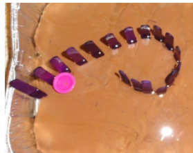
Loop-weir corraling a fish towards the trap