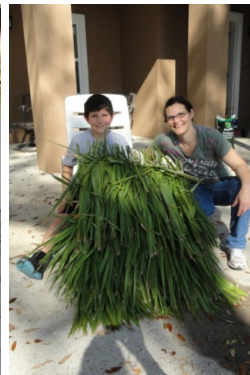
Completed palmetto wall