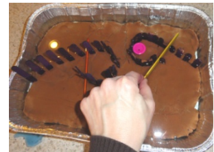
Two Loop Weirs, the leftmost being gated to corral the captured fish