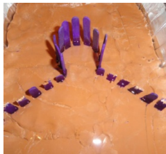
V-weir showing difference in post heights