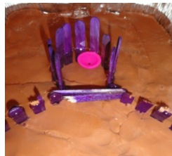
V-weir with fish trapped by gate