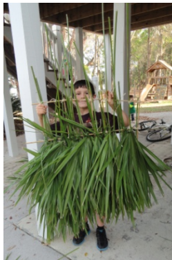
Thatching up to the second weaver