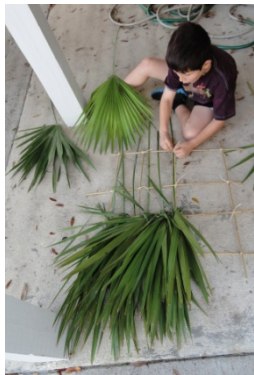
Thatching up to the first weaver