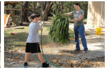
Testing for Water Resistance